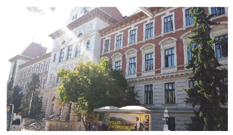
BOKU University building

Amazing city of Vienna made a huge impression on me. Everything is very organised and people are very nice. I would definitely go back to work on managing some communal system in Vienna. I made a lot of friends in Vienna and I'm hoping to stay in touch with them and see them again some day.