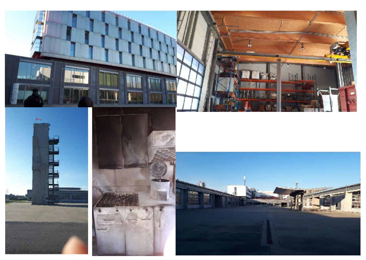
Training center for Disaster management in Tulln