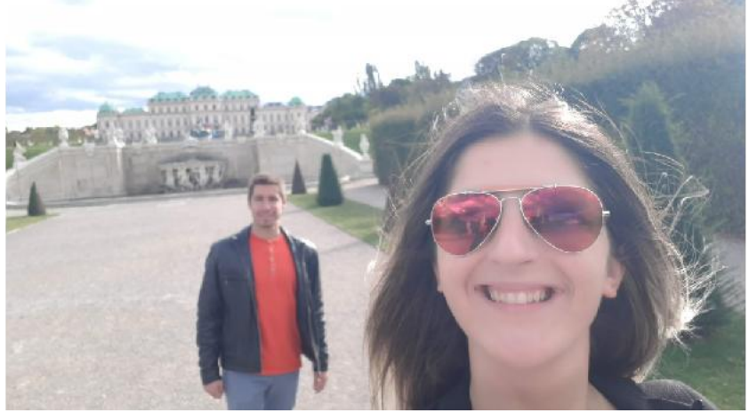
Visiting Schonbrunn and Belvedere palace