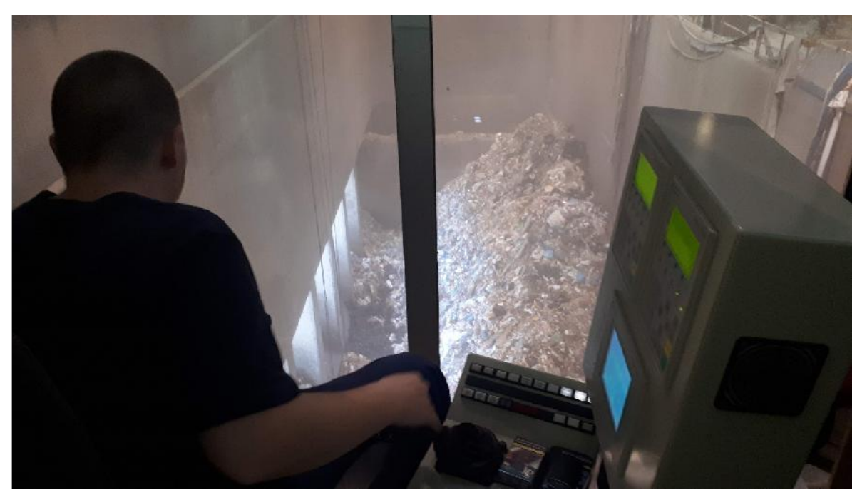
Crane being used to move mixed garbage to incineratior