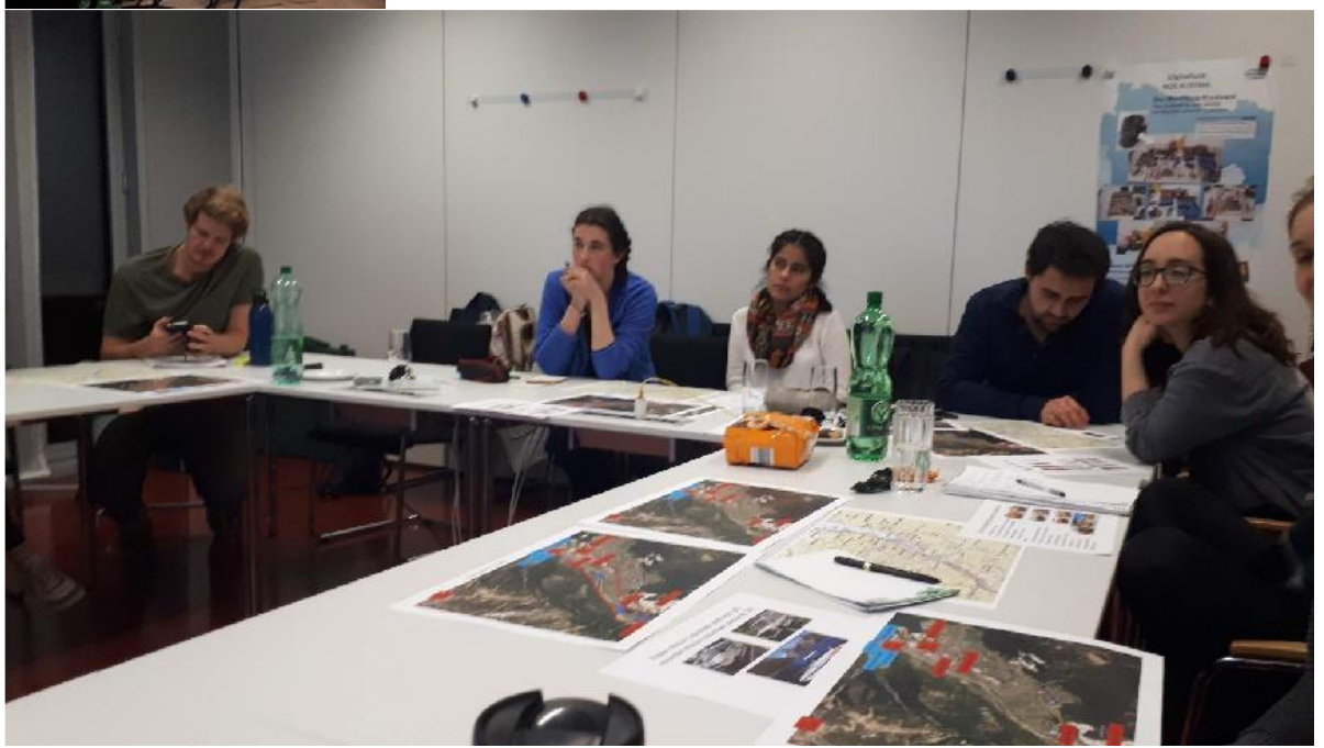
Practising disaster management on a case study in Training center in Tulln