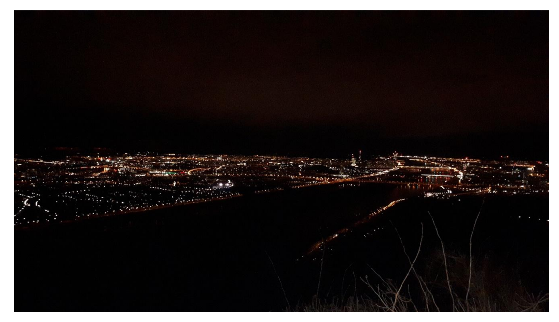
Vienna at night

Project number: 573806-EPP-1-2016-1-RS-EPPKA2-CBHE-JP