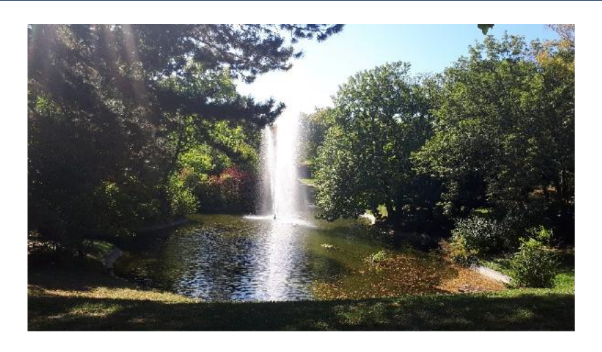
Beautiful park near University building