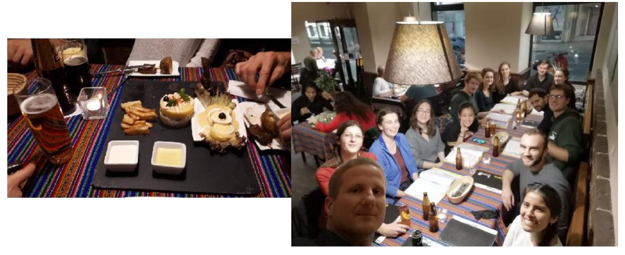
Dinner with collegues and professor from Disaster management in Peruvian restaurant

The BOKU University also gave me opportunity to participate in project about beverage can recycling in my home country in order to find out real state of beverage can disposal in Serbia.