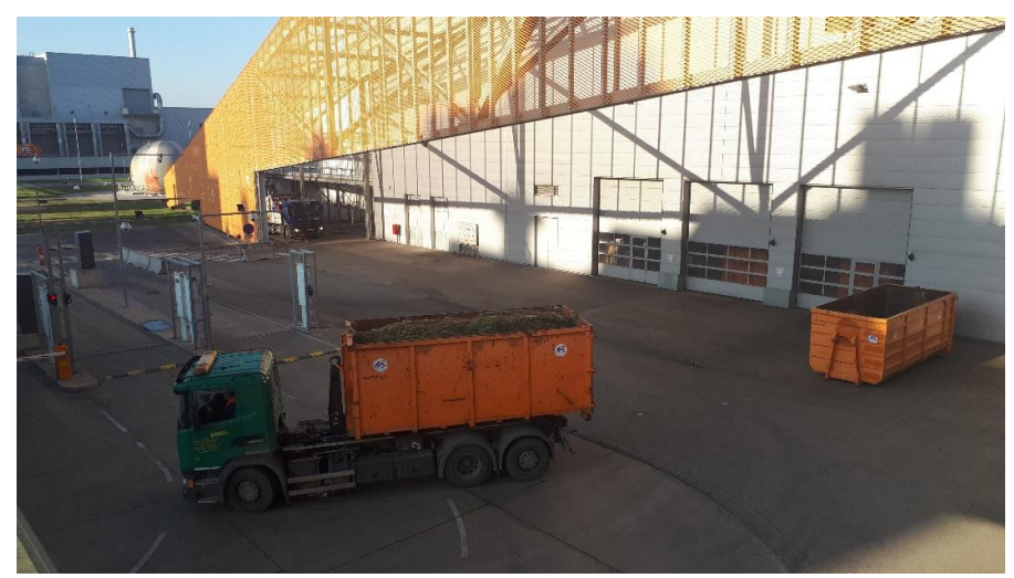
Safety first! Visiting incineration plant in Vienna